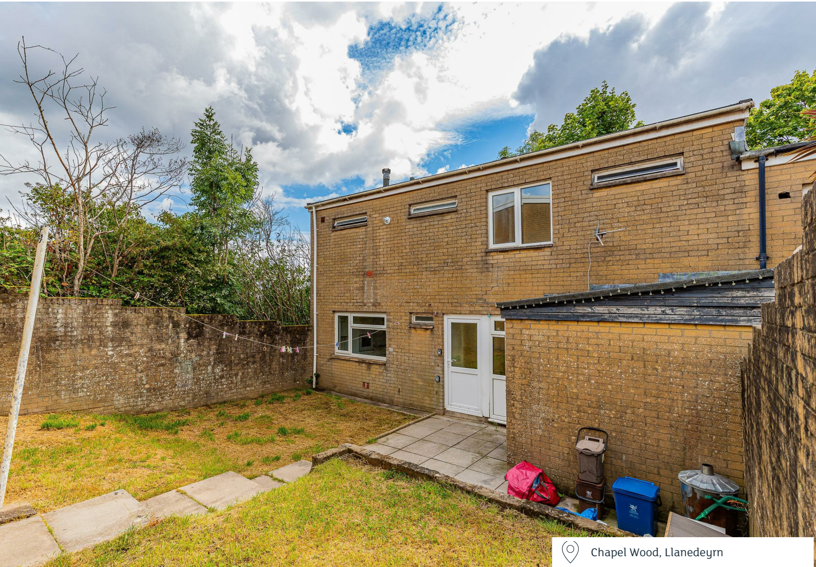
Chapel Wood, Llanedeyrn